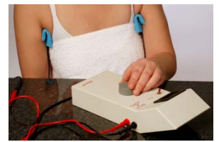
Treatment of the axillae

N.B. Please note that the circuit is only complete when the area to be treated is placed in the baths and filled with 400mls of tap water. When treating the underarm ensure the sponge pockets have been saturated in tap water and placed in the axillae. Before the commencement of the treatment protocol please ensure that you have read the instruction manual enclosed with the machine.