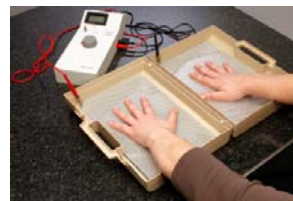
Treatment of the hands