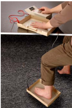
Treatment of one hand and one foot