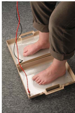
Treatment of the feet