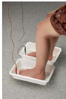
Connect the foot trays